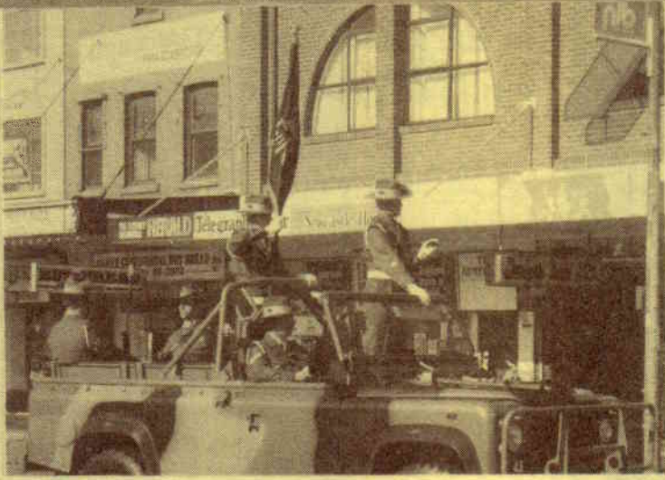
FREEDOM OF THE CITY OF NEWCASTLE 7 June 1992