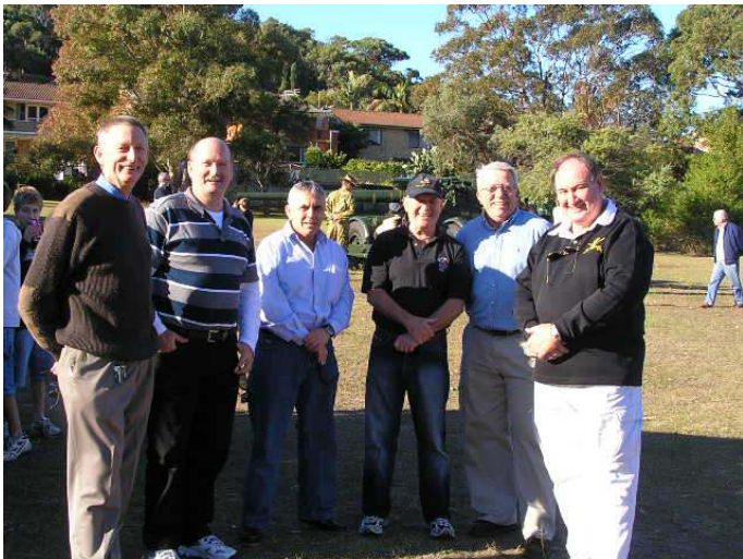
50 th Anniversary of the Opening of Dee Why 24 Jun 06