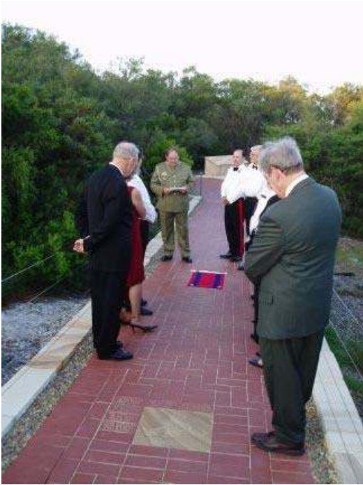
The Dedication of The Regimental Paver at North Fort Museum