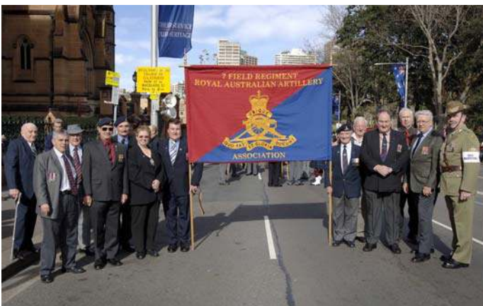
Reserve Forces Day 2 Jul 2006