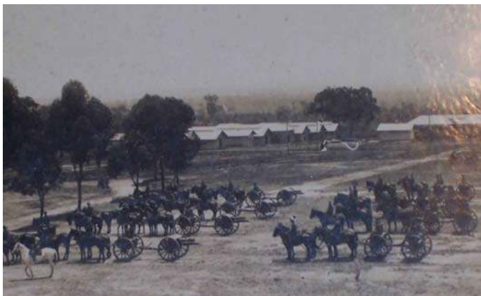
27 Bty on Parade at their 1925 Holsworthy AFX