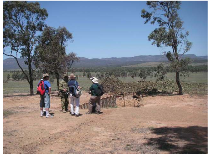
Members enjoying a mouthful a Singo dust