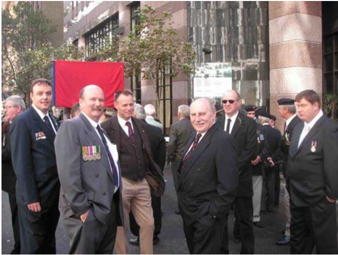
Anzac Day 2006

It would be great to see the all of the Association proudly wearing their new medal at next years Anzac and Reserve Forces Day Parades.