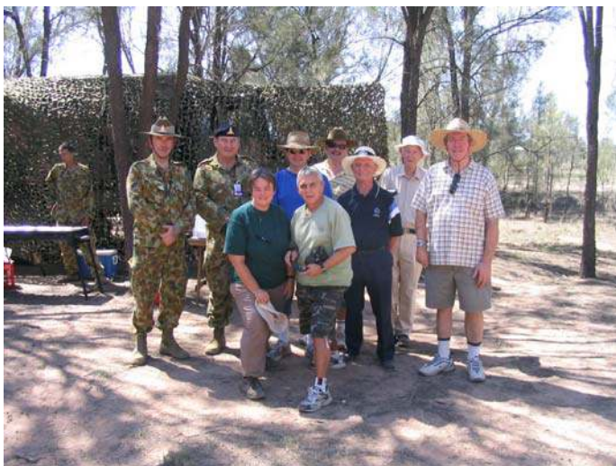
7 Fd Association members at the LFX 14 Oct 06

However that did not stop us dreaming of a good wiff of the cordite smoke to bring back those fond memories or the nightmares of your No 1 or Seco.