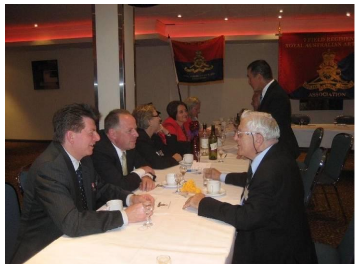
Annual Reunion 2008 Hornsby RSL