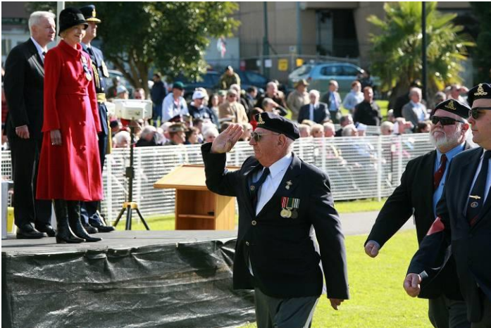
Reserve Forces Day Parade, 2010