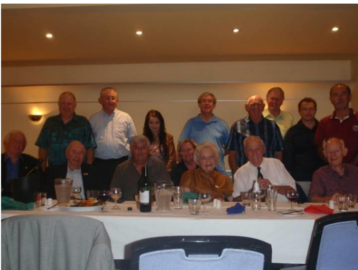
Members and their guests at the Anzac Luncheon.

A new event which commenced this year is the Anzac Luncheon, being held on a Sunday prior to Anzac Day. At the Inaugural luncheon, there were 14 ex-gunners present, and hopefully with greater PR work, we will increase this number next year.