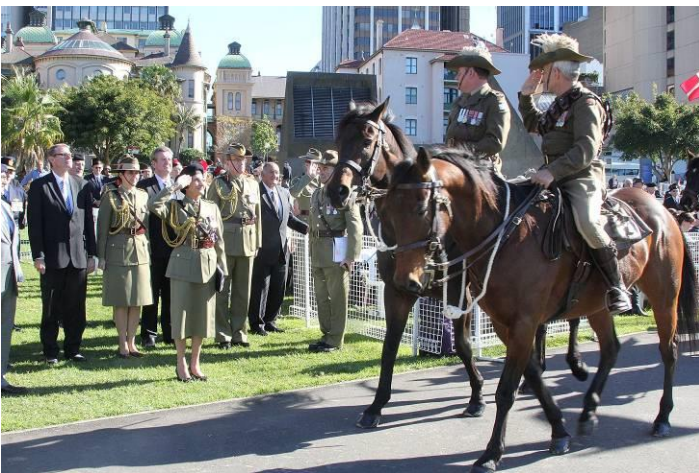
Reserve Forces Day Parade, 2011