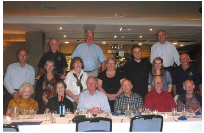
Members and their guests at the Anzac Luncheon.