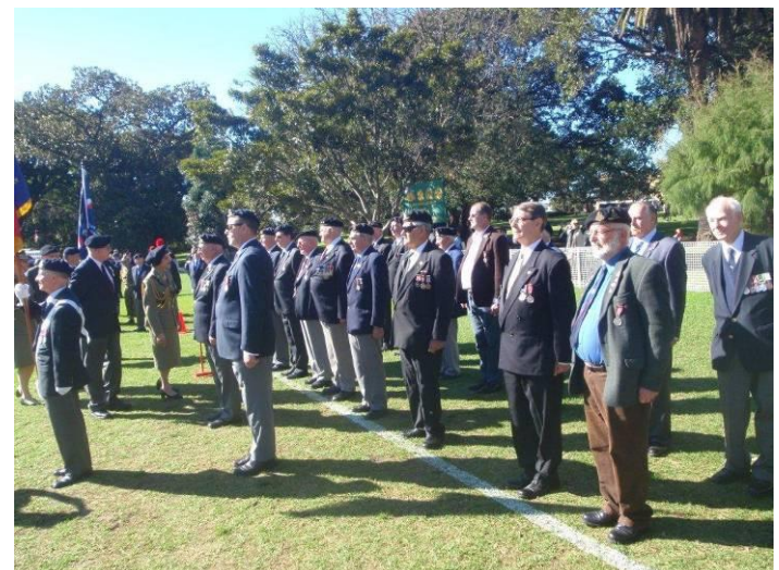
Reserve Forces Day Parade, 2011