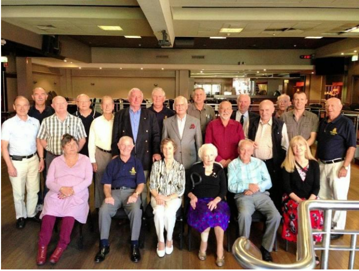
Members and guests at the 2013 Anzac Luncheon.