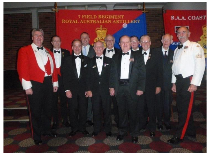
Gunner Dinner – Aug 2013