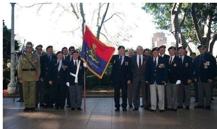
Reserve Forces Day Parade, 2013