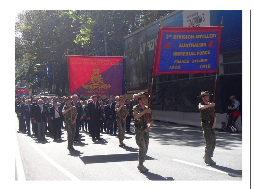
ANZAC Day 2016