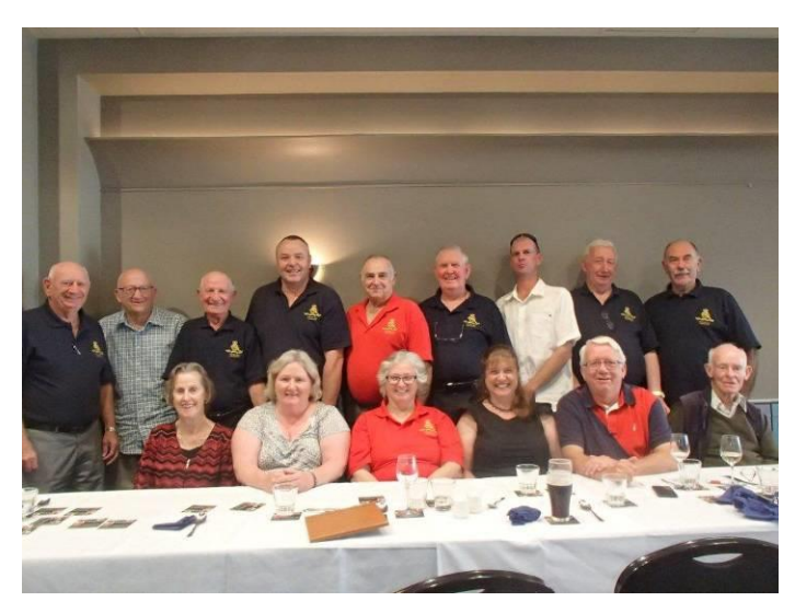
Members and guests at the 2016 ANZAC Luncheon.