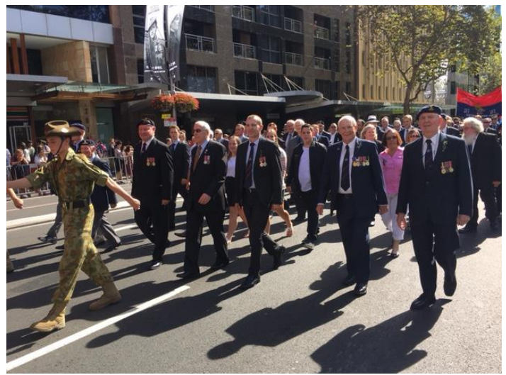
ANZAC Day 2017