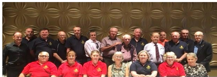
Members and guests at the 2017 ANZAC Luncheon.