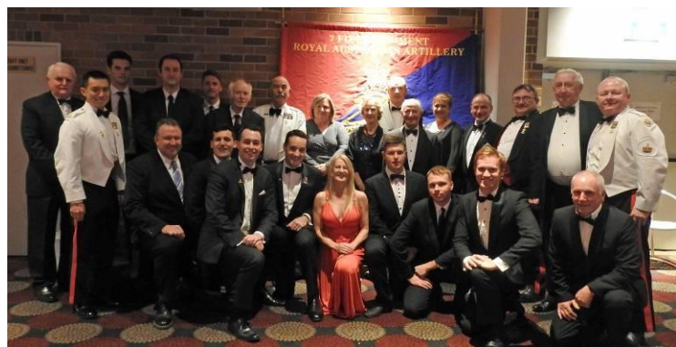
Serving Members join the Association Members at the Gunner Dinner