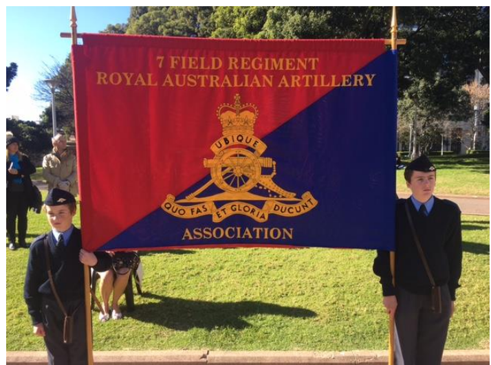
RFD Parade July 2017