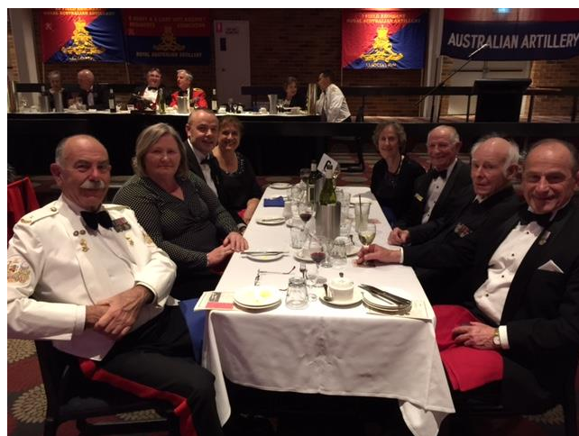
Gunner Dinner – August 2017