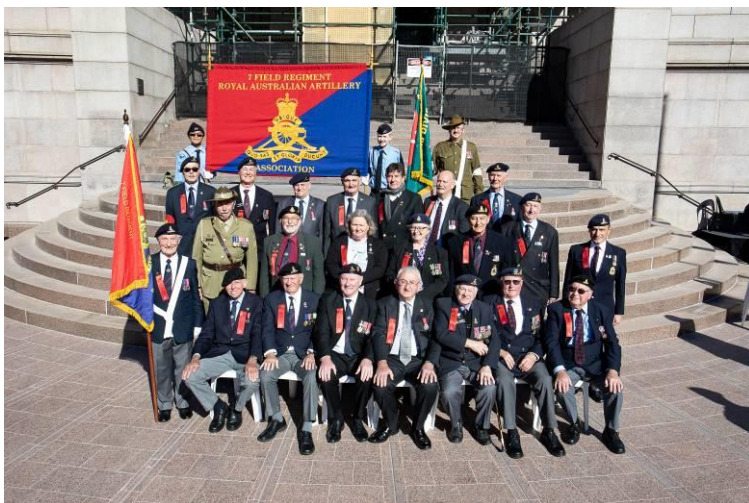
RFD Parade July 2018