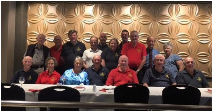
Members and guests at the 2018 ANZAC Luncheon.