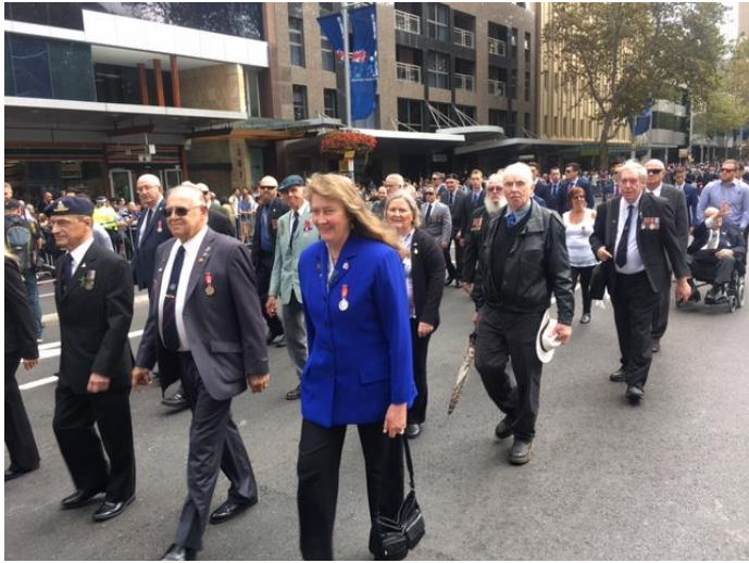
ANZAC DAY 2018