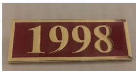
Special 1998 Bar presented to Association members who attended both 1998 & 2018 RFD Parades