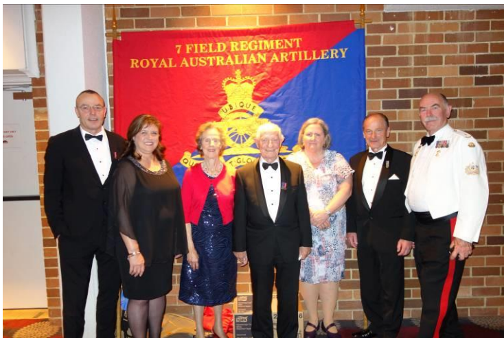
Gunner Dinner – August 2018