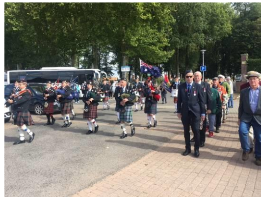
Villers Bretonneux parade & presentation

The second highlight was at Villers Bretonneux with the presentation of a plaque to the Director of the Museum above the school (L'Ecole Victoria). A similar plaque was presented by Association members in April 1990.