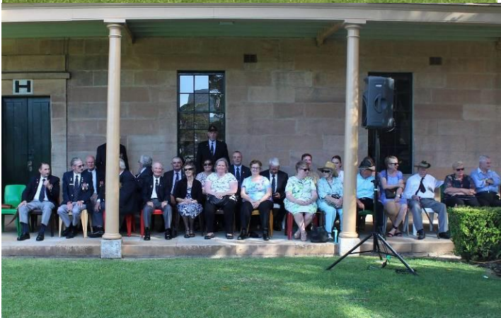
Association members observing the Parade