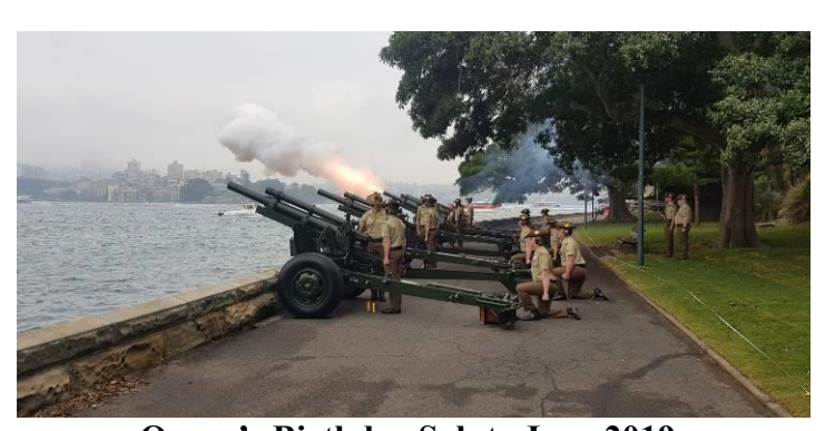
Queen's Birthday Salute June 2019