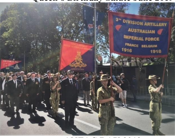
ANZAC DAY 2019