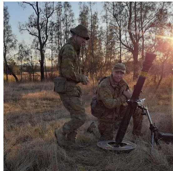
Mortar support to ROBC at Singleton July 20