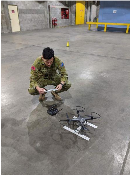
Multi-Rotor Unmanned Aerial System (MRUAS) Training Aug 20