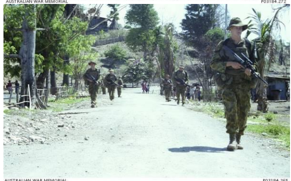
Gunner Sage 108 th Field Battery foot patrol

When INTERFET handed over to the United Nations Transitional Authority East Timor (UNTAET), in February 2000, Army's contribution downsized from a brigade to a battalion group operation in AO Matilda of Sector West. Under OP Tanager and subsequently OP Citadel the Australian battalion groups (AUSBATT) commenced a six-monthly rotation program from 2000 through to 2004 (AUSBATTs I-IX), which meant that by the time Sector West was finally evacuated in 2004 all of the infantry battalions and subsequently all the ARA gun batteries and elements from 131 st Battery had deployed to East Timor. After 2006, further deployments were enjoyed by Gunner contributions to the ANZAC Battlegroups of OP Astute , which included 4 th Field Regiment and batteries from 16 th AD Regiment in the infantry role.