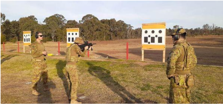
EF88 Weapon Training July 20