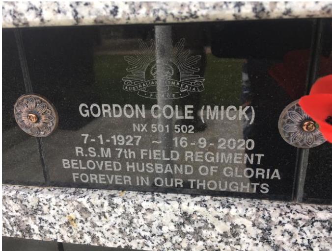
Columbarium at Frenchs Forest Bushland Cemetery (Note the reference to 7 FD Regt)