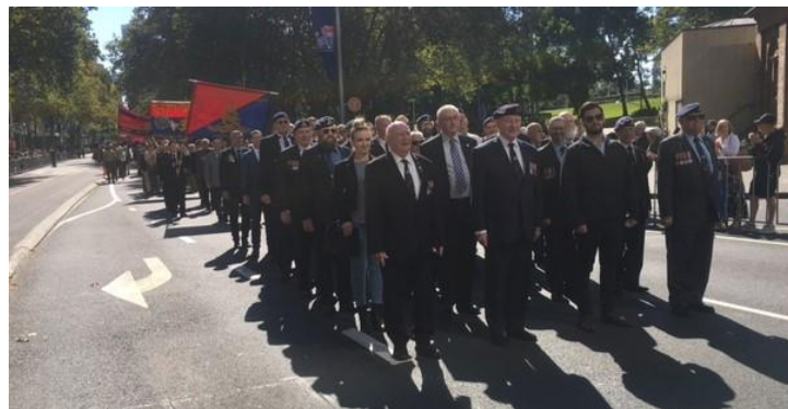
ANZAC DAY 2021