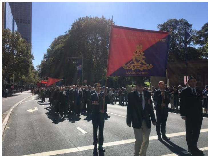
ANZAC DAY 2021