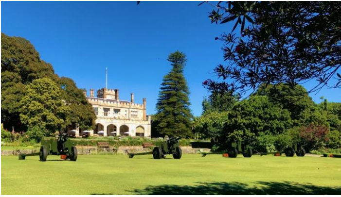
Australia Day Salute at Government House 26 January 2021