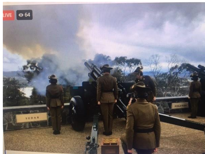
RAA 150 th Anniversary Salute Mt Pleasant, CANBERRA 1 August 2021

All Other planned activities including the New Queen's Banner Parade at Victoria Barracks have been cancelled due to Covid-19 and will be conducted in the new year