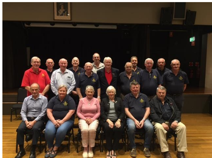
ANZAC LUNCH – CHATSWOOD RSL 2021