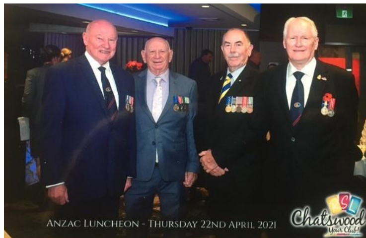
CHATSWOOD RSL CLUB ANZAC LUNCHEON