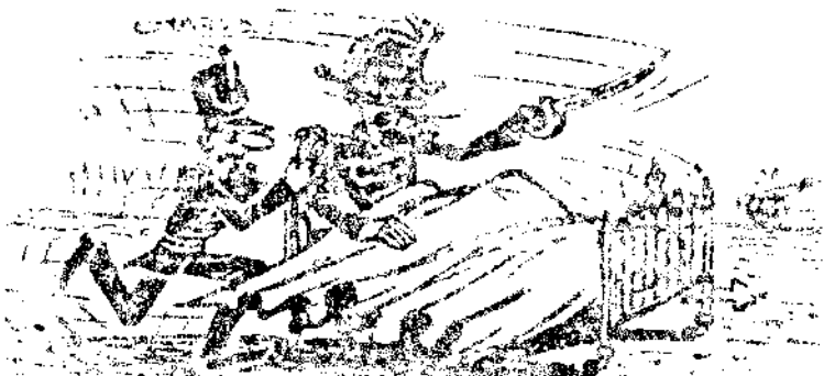
The Duke of Wellington said, 'This army must be led.' He said, 'Follow my men. We will eat them again. Just as you will get out of it.'