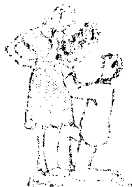
"You're trying to annoy the boys, aren't you?"

TO ALL THE ARA GUYS VISITING US & ASSISTING THE BATTERY WITH YOUR EXPERT KNOWLEDGE. WE HOPE YOU ALSO LEARNED SOMETHING ABOUT US.