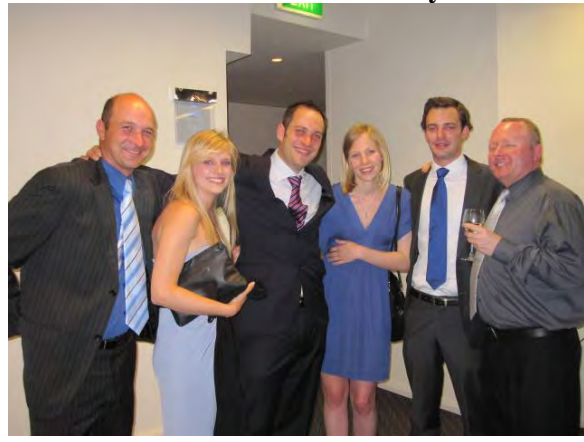
Ports and Hoss trying to grass cut 28 Seco's