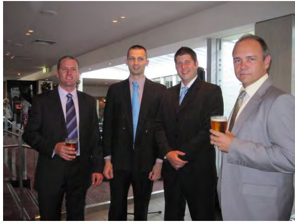
I want more beer