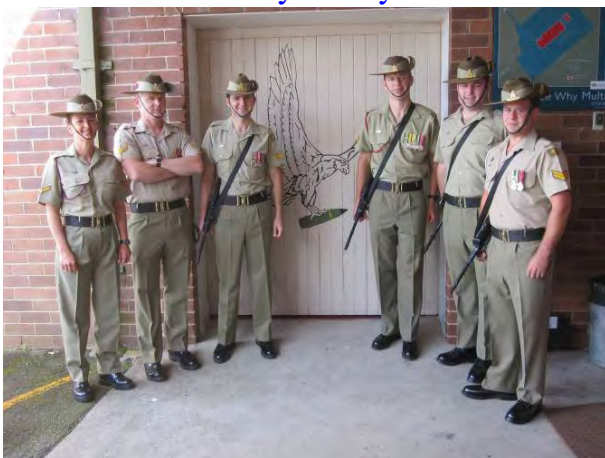
Remembrance Day Manly Dam