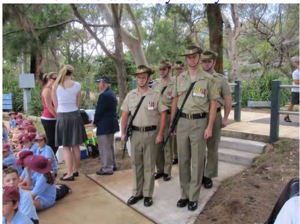
Remembrance Day Manly Dam