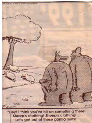
For those who remember "Battle Dress"