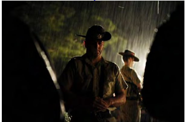
Anzac Day Manly Dam