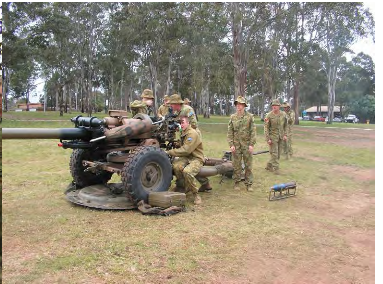
Anti-tank Drills – Gun Course