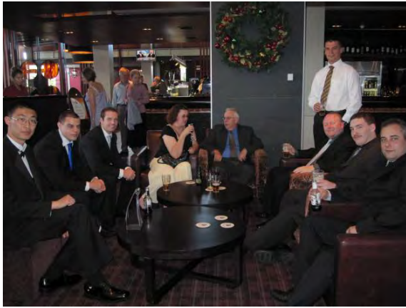
113 testing out the leather lounges