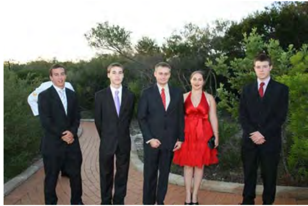
113 diggers looking for the bar