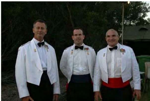
CO, OPSO and 2IC