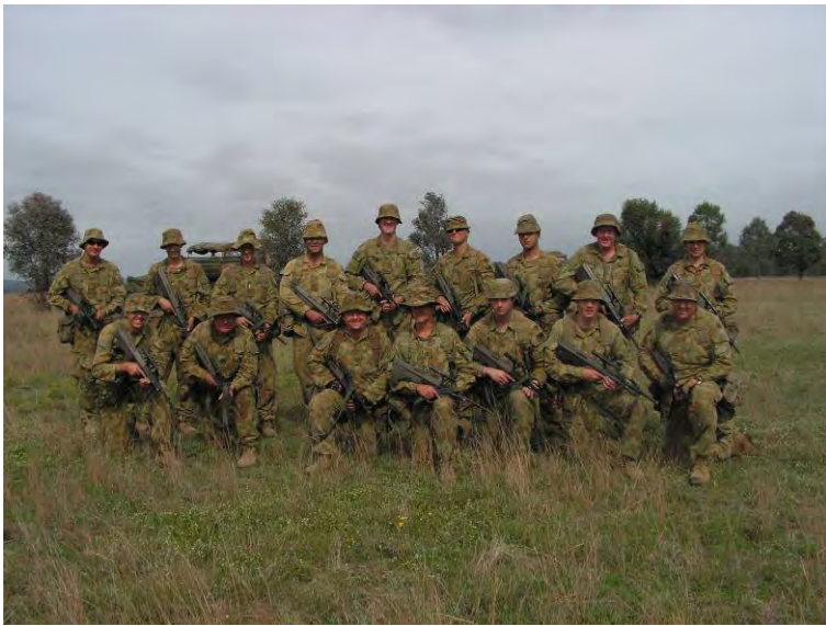
Advanced Gunner Course