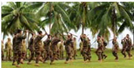
Tongan Defence Soldiers welcome the new rotation with a “challenge song“

We were involved in one major operation which included the dismantling of an illegal stall setup in White River where locals were selling Quazo (illegally brewed alcohol) and cannabis. One of the platoons secured a ridge for the command post whilst the other 2 platoons remained on QRF (Quick reaction force). The operation was a great success with the Army playing a major role in achieving this outcome.