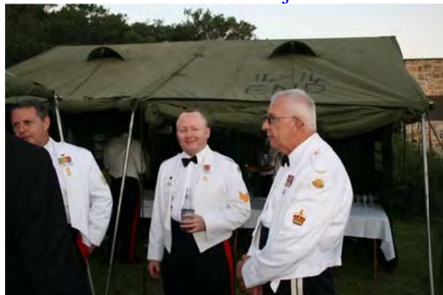
113 Bty Snakes...