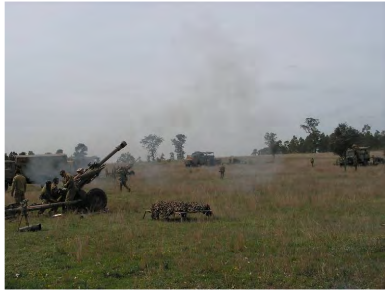
Rounds down range