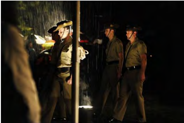
Anzac Day Manly Dam