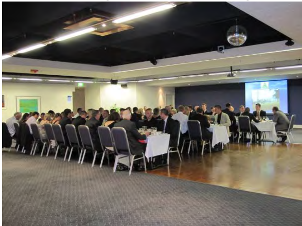
More Wine hic....