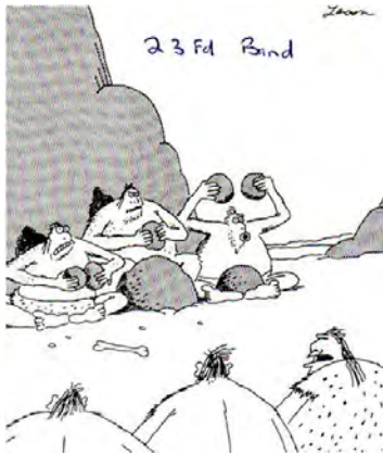
23 FD Band