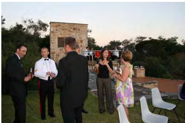
The 23 FD band, next yr it's AC/DC !!