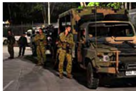
Soldiers wait by vehicles during a night patrol in Honiara

One of the most memorable moments of my deployment was being involved in an Operation with the RAAF targeting illegal fishing vessels off the coast of Vanuatu and surrounds. The RAAF conducted the operation within a P-3C Orion aircraft with the primary mission being to obtain information on vessels conducting suspicious activity in the area. Being on board this aircraft for just over 8 hours was a very different experience. The Army medic who accompanied me unfortunately became sick one hour into the flight.