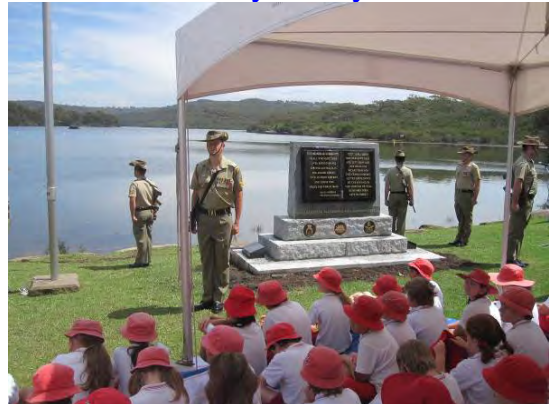
Remembrance Day Manly Dam