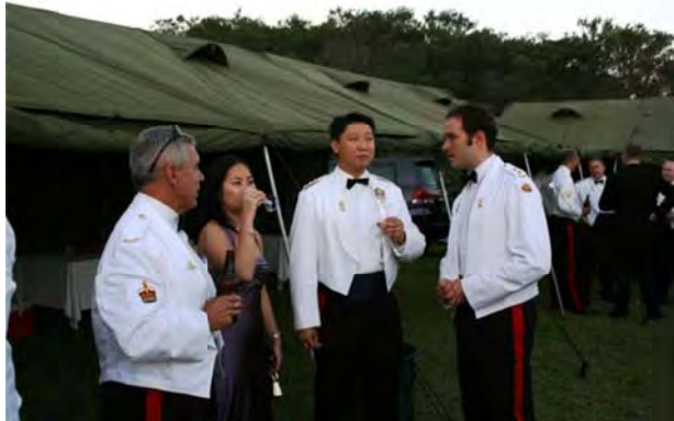
Your shout Adj...