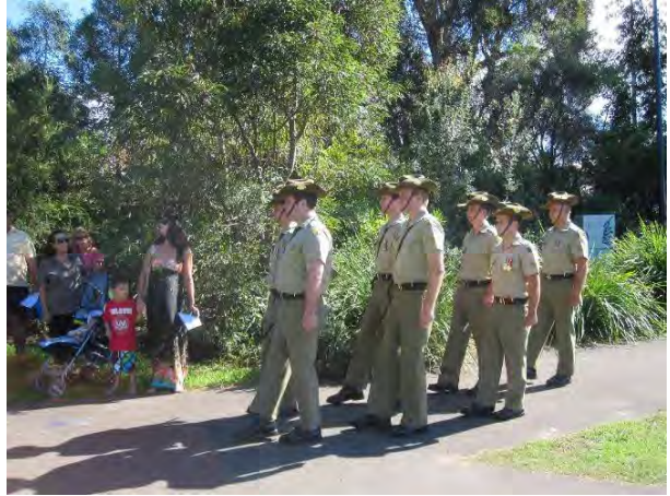
Anzac Sunday Mona Vale