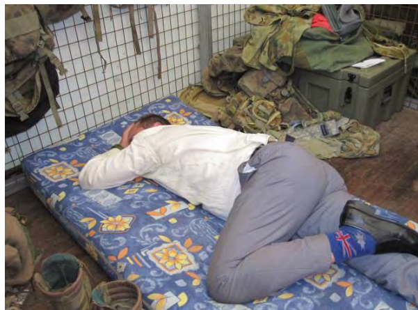
Guess who (nice socks)