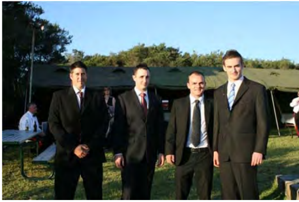
28 diggers ready for a big night