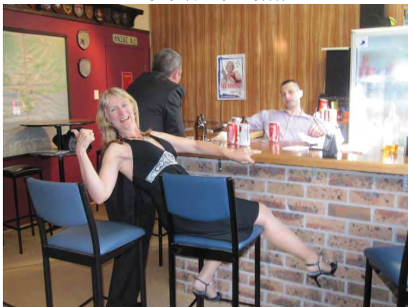
Last one's standing