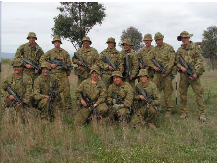
Gunner Grade One Course