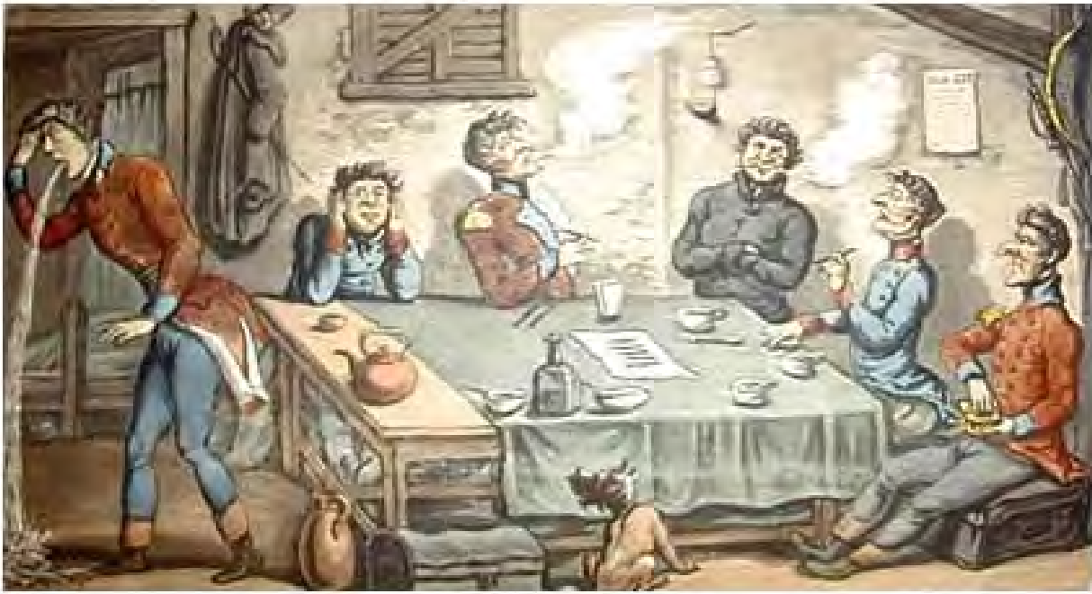
The Education of a Young Officer – Learning How to Smoke and Drink Grog