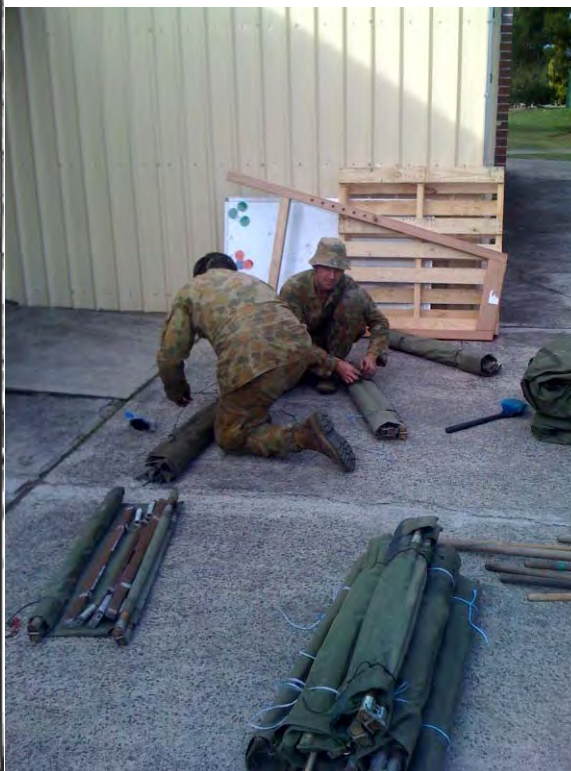
SMH 24 Aug 1948 CMF Add

These Training Depots do not cover country areas, details of which are appearing in the country Press.