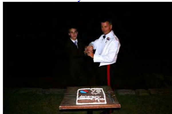
The Regiment, 94 years old