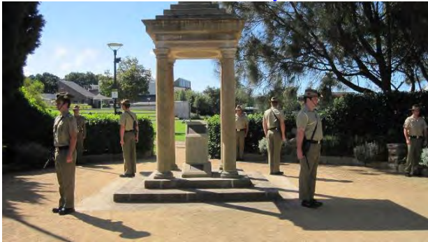
Anzac Sunday Mona Vale