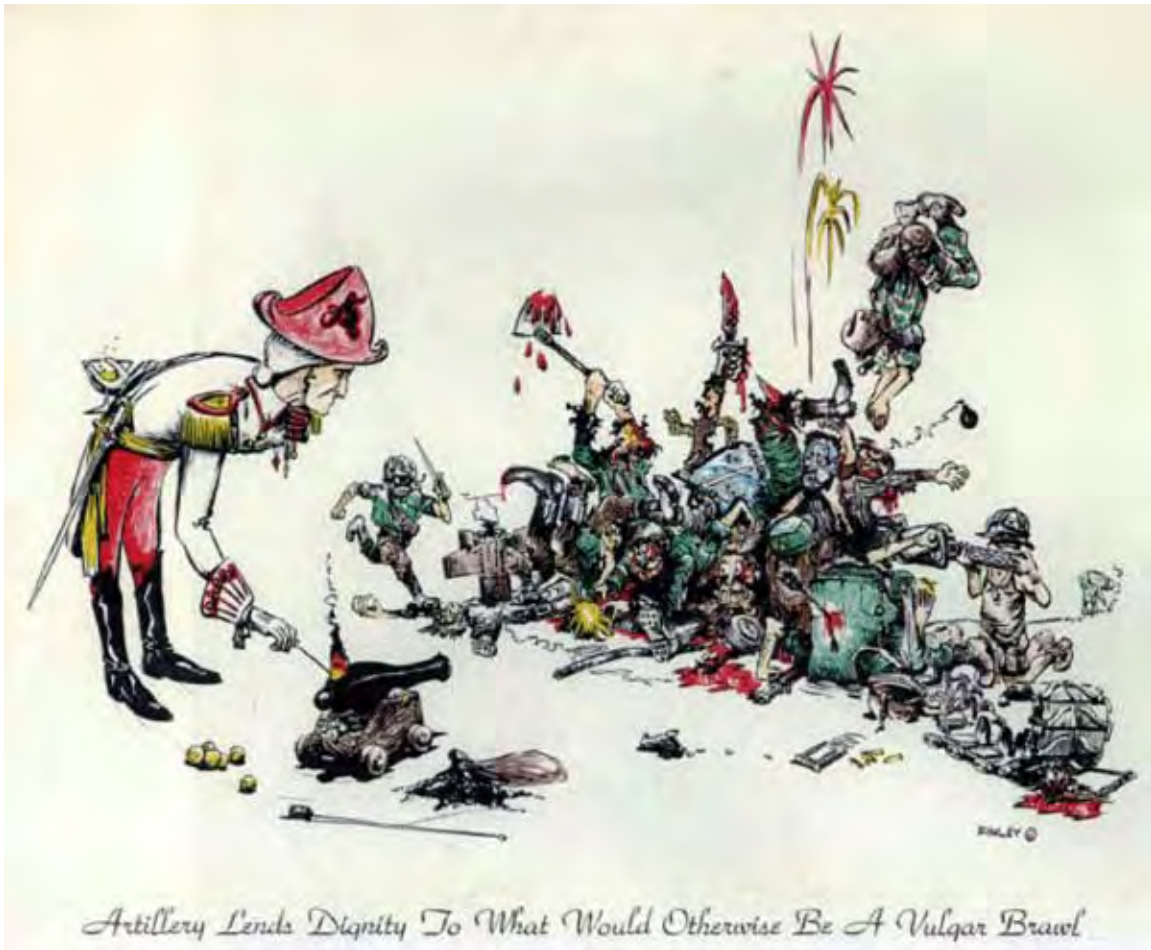
Artillery Lends Dignity To What Would Otherwise Be A Vulgar Brawl