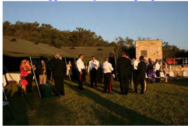
Members enjoying the drinks and the view