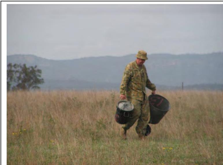
RSM gets some shit jobs too.