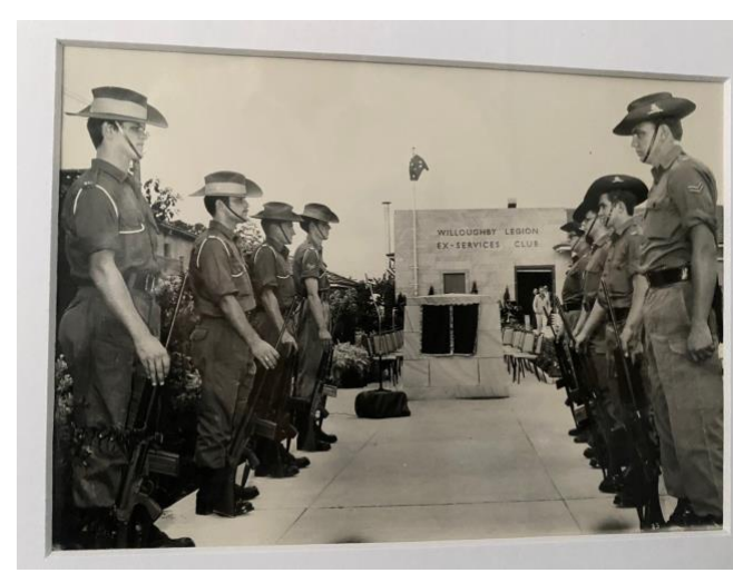
How many Members/Ex-Members do you recognise in this historical photo?