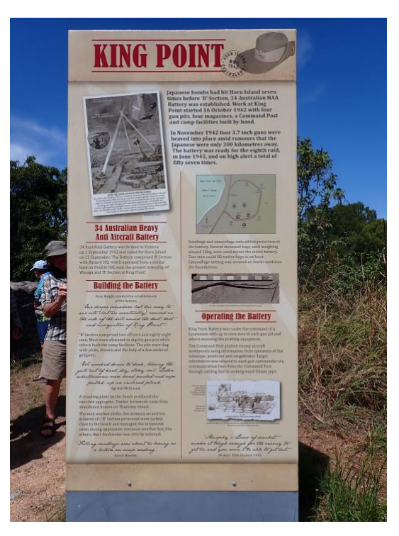
Interpretative signage outlining the Artillery History on Horn Island