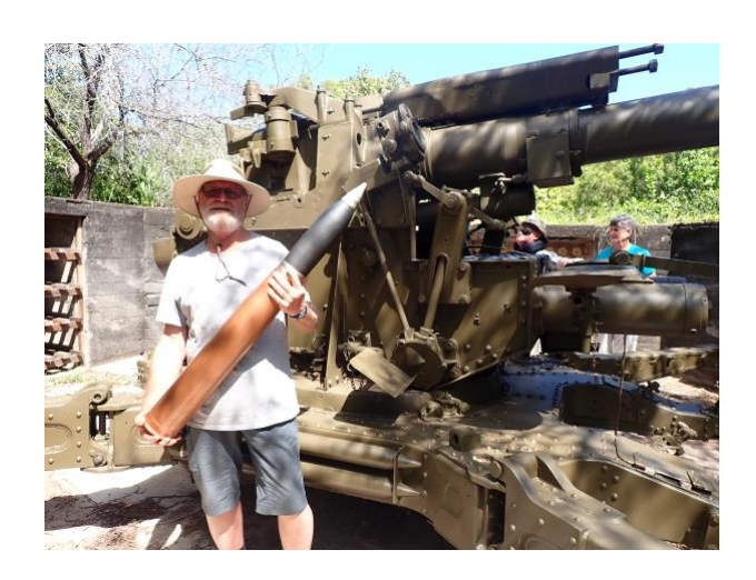
Replica of a 3.7 inch shell with the gun in its gun pit.