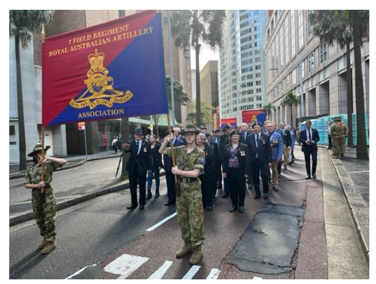
ANZAC DAY 2022