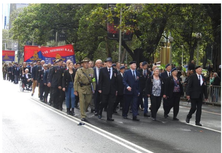
ANZAC DAY 2022