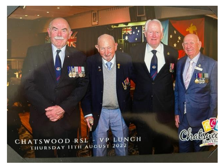
CHATSWOOD RSL CLUB VP LUNCHEON AUG 2022