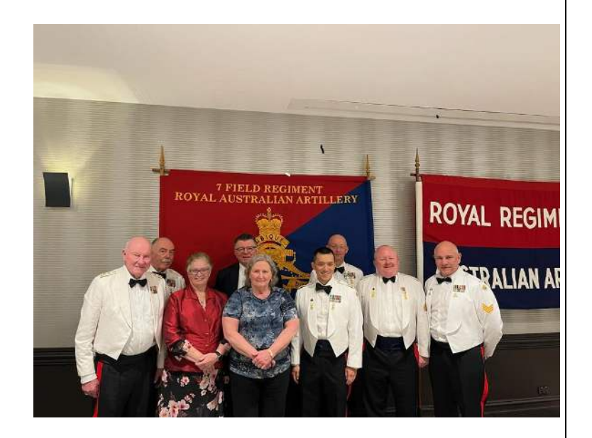
GUNNER DINNER AUGUST 2024